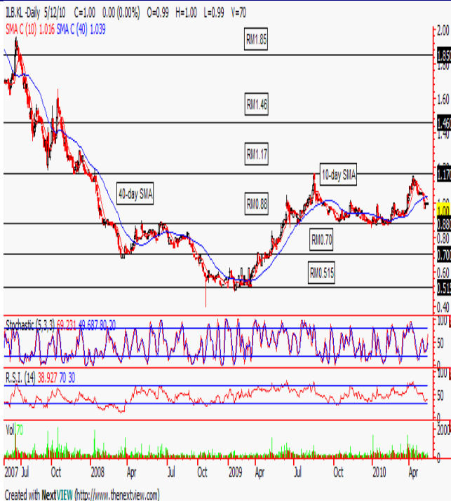
Chart 1: ILB Technical View Point