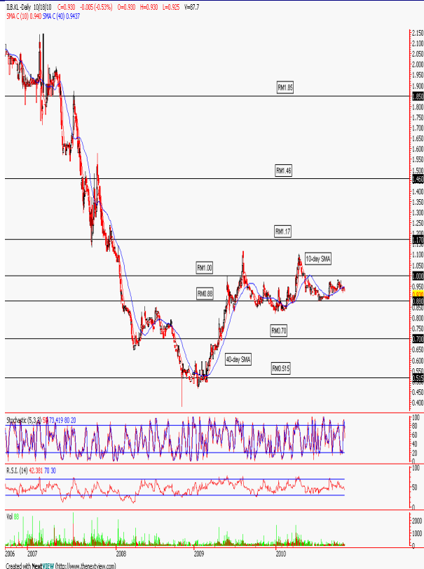
Chart 3: ILB Technical View Point